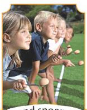
egg and spoon race

Choose a race. Then, act out the scene with your classmates.