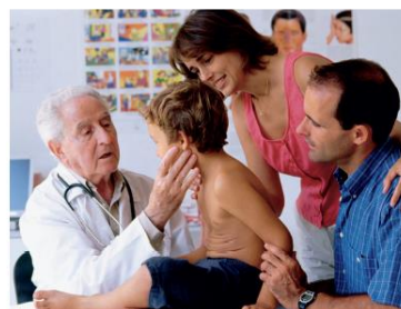
When we are sick, we need to see a doctor.