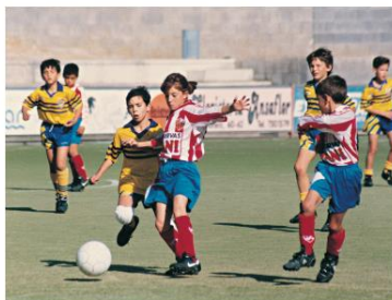
We need to exercise to be strong and fit.