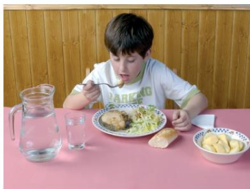
We need to eat breakfast, lunch, a snack and dinner every day.