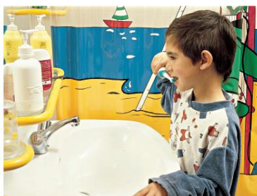
We need to brush our teeth every day.