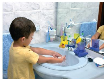
We need to wash every day.