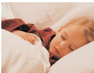
We need to sleep well.